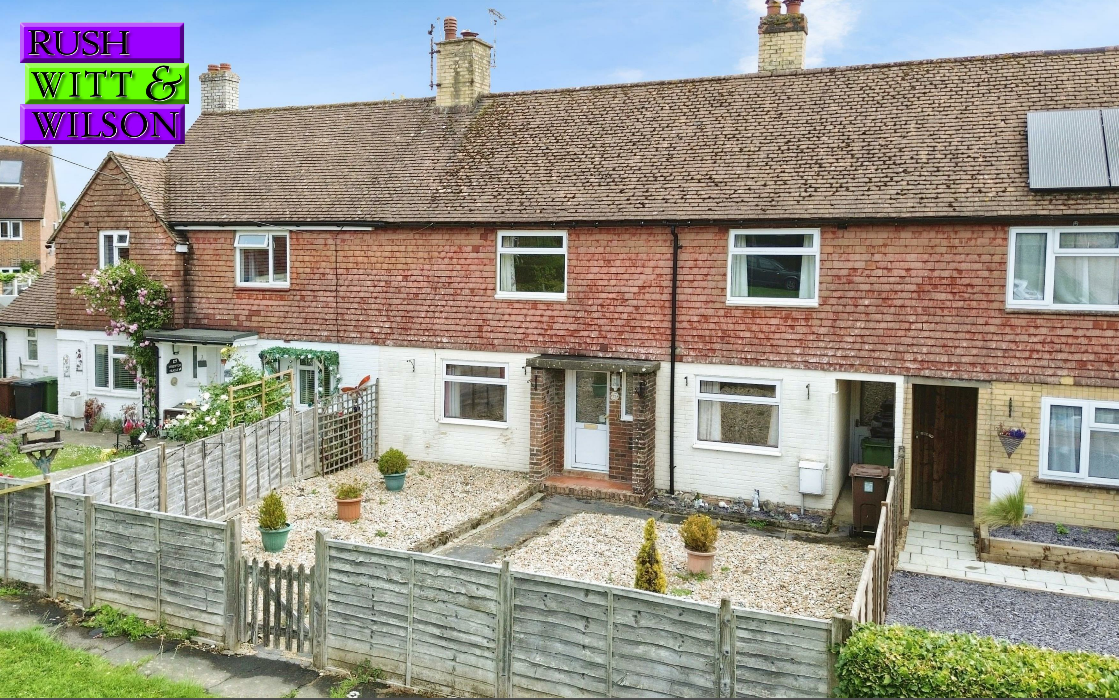
18 Coplands Rise, Northiam, East Sussex, TN31 6PU. Guide Price £295,000 Freehold